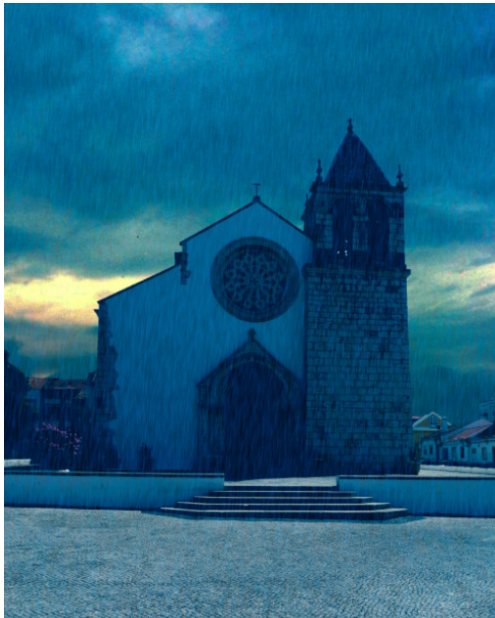
(The above picture is of Alcochete. Artistic liberties taken.)